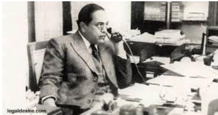
Baba Saheb B R Ambedkar

Not in the distant past, the news of dead dogs being thrown in the wells owned by generally suppressed Dalits in South Delhi was reported and for many quarters it was not a surprise. The memories are still fresh with India's erstwhile Deputy Prime Minister and Defence Minister, Babu Jagjivan Ram's visit to Birla Mandir when the temple was thoroughly washed and cleaned; an insult in a brazen manner to the visiting dignitary. There are unending stories that are recorded to depict the atrocities committed on weak, poverty stricken Dalits from times immemorial and even continue today in twenty first century suffering humiliation at the hands of upper-caste privileged Brahmans.